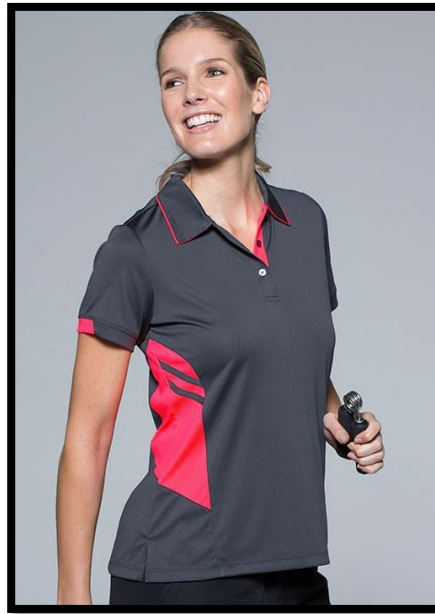
Slate/ Neon Pink